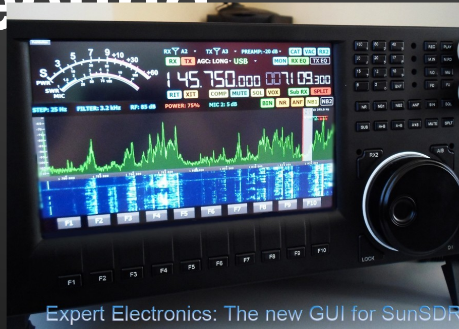
Expert Electronics: The new GUI for SunSDR